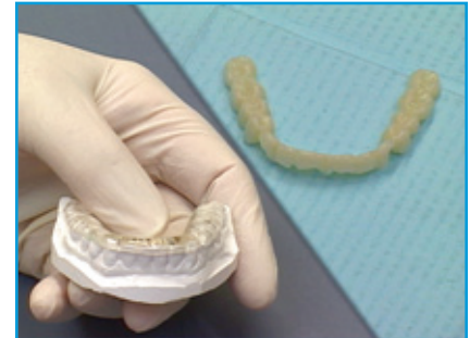
Orthotics stabilize the bite