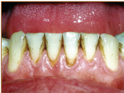
Smoking contributes to gum disease

By now almost everyone knows that smoking has been linked with lung disease, cancer, and heart disease. But most people aren't aware that smokers are three to six times more likely to have periodontal disease, and two times more likely to lose teeth.